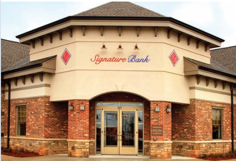
THE FORSYTH FINANCIAL CENTER, AT 505 PEACHTREE PARKWAY IN CUMMING, OPENED ITS DOORS FOR BUSINESS ON APRIL 14, 2008.